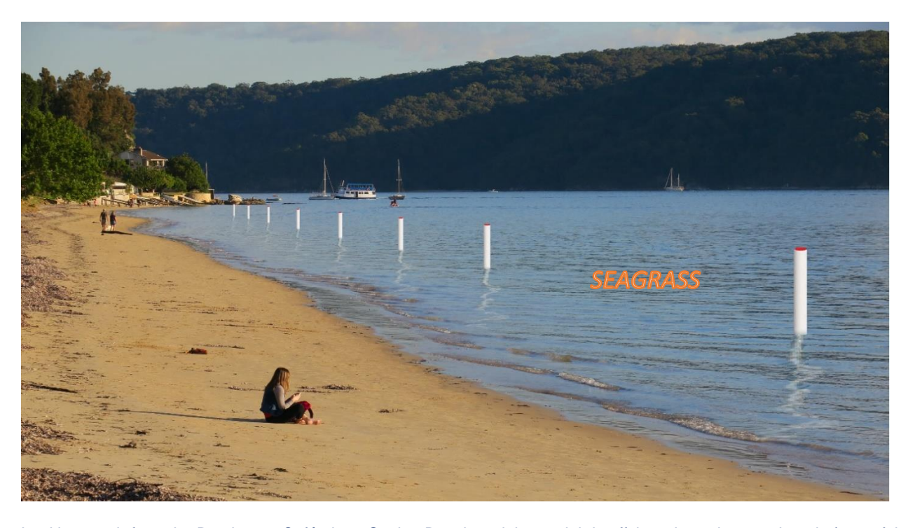
Looking south from the Boathouse Café along Station Beach and the unsightly offshore boundary markers in front of the seagrass meadow. These markers will be fully exposed at very low tides.