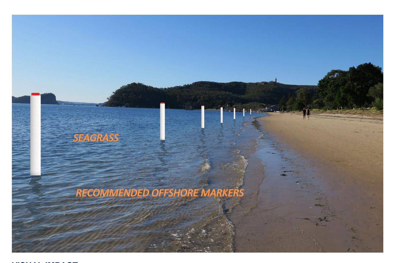
VISUAL IMPACT : Offshore boundary markers defining the 3m Buffer Zone in front of the seagrass at Station Beach. Up to 7 markers, 2.5m high are expected over the 600m off-leash area.