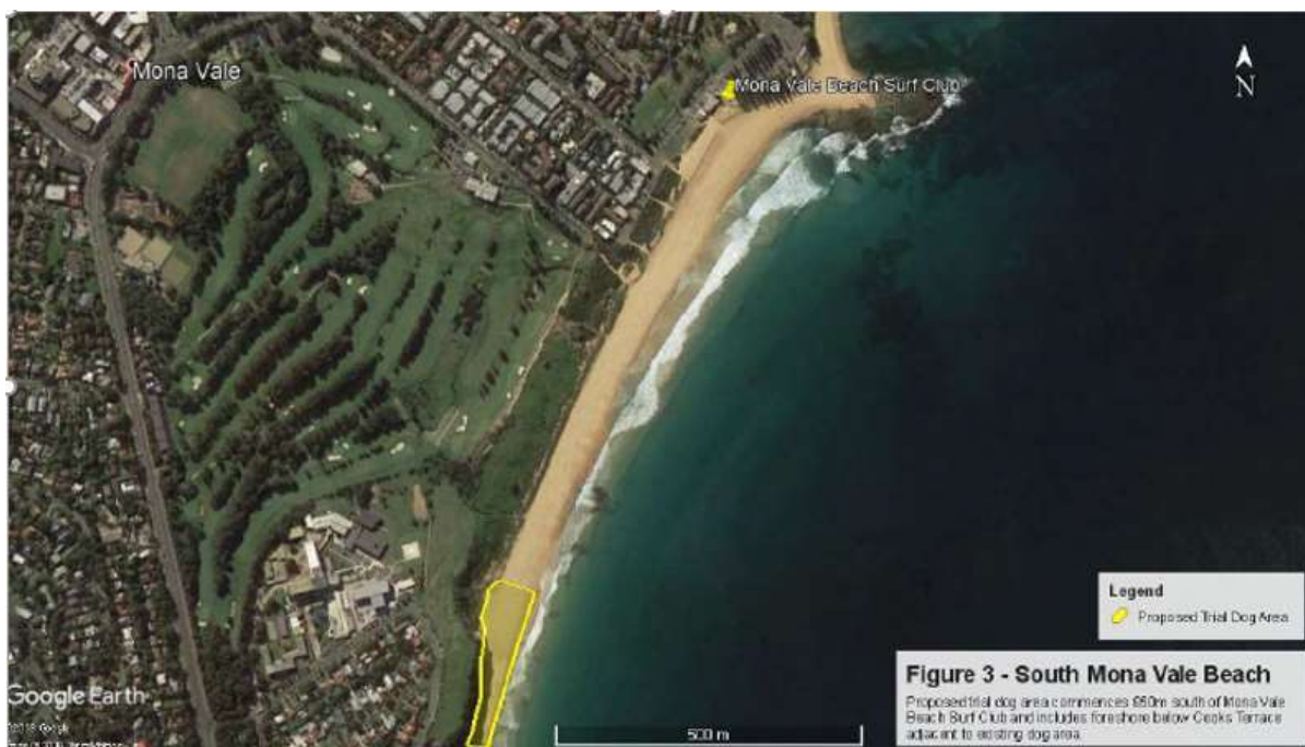
Figure 2: Excerpt from Notice of Motion No 33/2020 South Mona Vale Beach

The Mona Vale Beach (south) dog off-leash area proposed in the Notice of Motion is illustrated in Figure 2 below (titled as Figure 3).